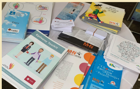
CMEA's stand at the Fresher's Week at MCAST (see page 5)