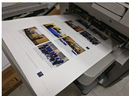
The printing of the 25th Anniversary Book at Best Print, Qrendi.